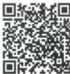
Rose Tour 2023 - Google My Maps